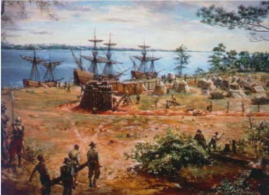
Color Photo with permission of the National Park Service.