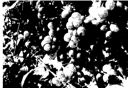
THE FAMOUS HIGGINS MUSCADINE GRAPE

PHONE 658-5456 -- ROUTE NO. 1 WHITWELL, TENNESSEE